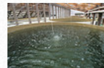
Whiskey Creek Hatchery