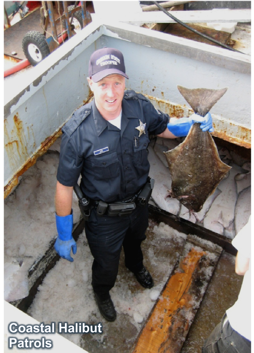
Coastal Halibut Patrols