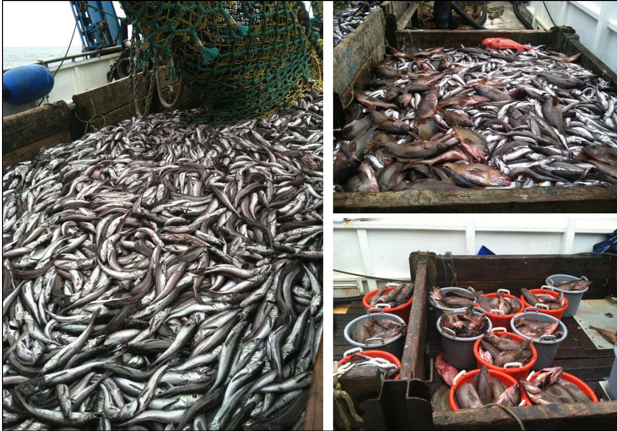
Figure 5. Photos illustrating results from a tow when testing design-B. Left image shows a portion of the codend catch (mostly Pacific hake), whereas the right top image shows the entire recapture net catch (mixture of rockfishes and Pacific hake). The bottom right image shows baskets of rockfishes sorted (mixture of yellowtail rockfish, widow rockfish, and rougheye rockfish) from the recapture net catch. For this tow the retention of hake was 95.1% while the escapement of rockfishes was 71.1%.