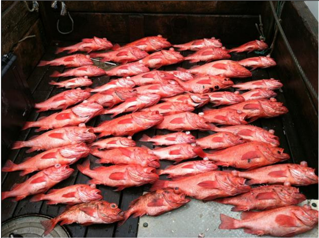
Figure 6. Rougheye rockfish and darkblotched rockfish caught in the recapture net during a tow when testing design-B. For this tow rougheye rockfish bycatch was reduced by 91.9%.