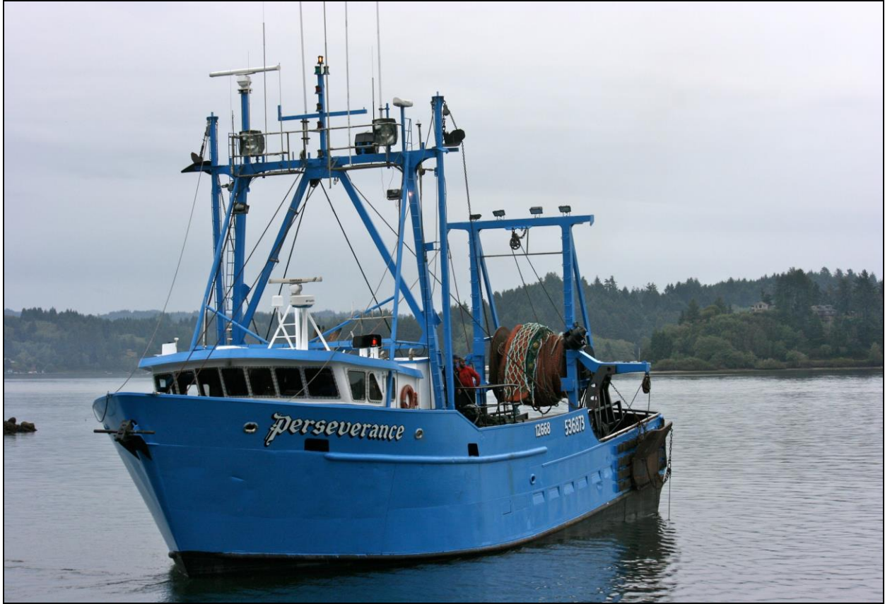
Figure 3. F/V Perseverance chartered for the research project.