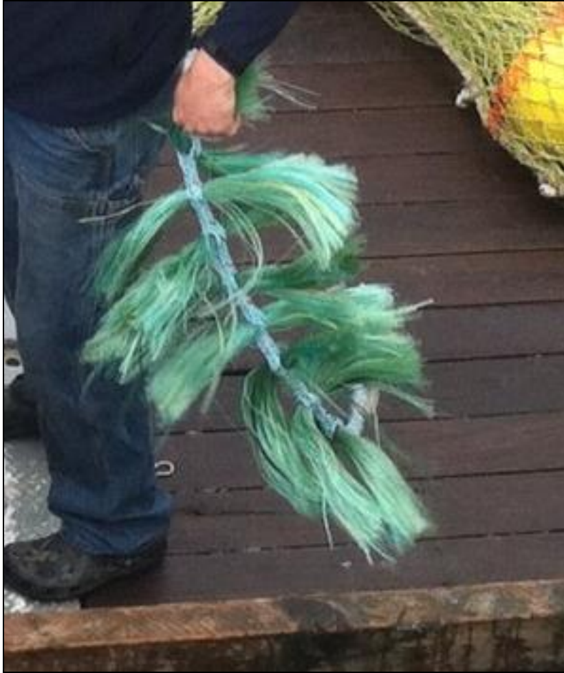
Figure 2. Image of one of the ropes with chaffing gear wedged through it that was used within the “hallway” section of the excluder in an attempt to stimulate fish to interact with the vertical sorting panels.