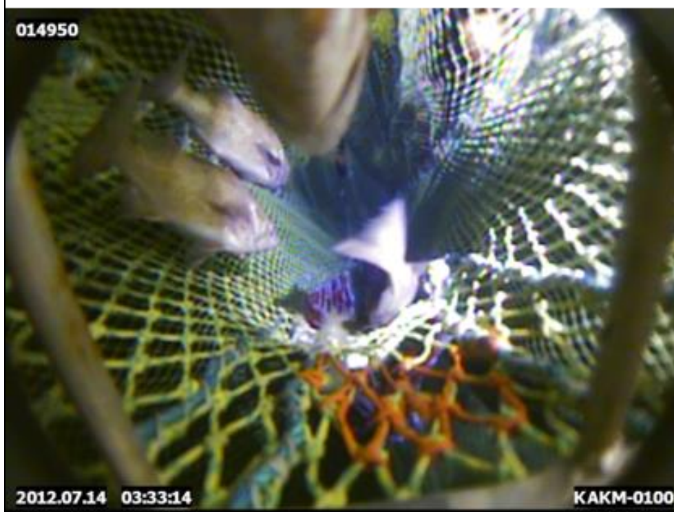
Figure 4. Video frame grabs showing canary rockfish and yellowtail rockfish (above, design-A) and widow rockfish (below, design-B) swimming inside the recapture net surrounding the exit ramp of the rockfish excluder tested.