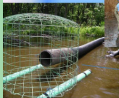
CASTOR MASTER: Double Walled Pipe & Round Fence Filter - Skip Lisle