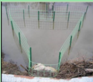
BEAVER DECEIVER : Trapezoidal Fencing in front of culvert – Skip Lisle