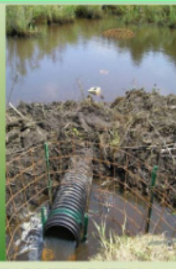
DOUBLE FILTER SYSTEM or PIPE & FENCE