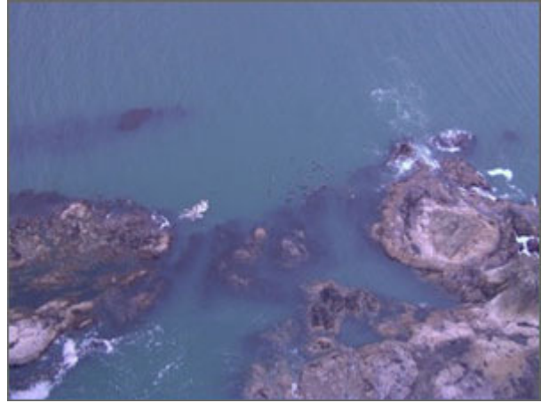
Sea Otters. (Photo: recorded by the UAS along Washington coast in Olympic Coast NMS)

NOAA is partnering with scientists and resource managers from U.S. Fish and Wildlife Service, National Park Service, and coastal treaty tribes. If successful, unmanned aircraft technology could be used in marine protected areas worldwide. Possible uses include wildlife surveys for seabirds, marine mammals and sea turtles, surveys to locate and identify marine debris and scientific data collection.