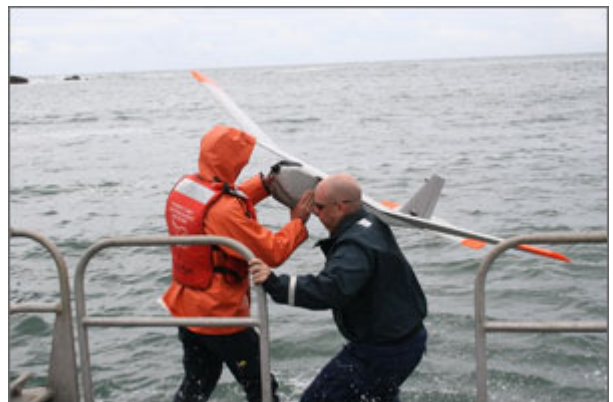
Launching UAS from deck of R/V Tatoosh .

The test of the Puma system, which can fly lower and slower than manned aircraft and are much quieter, is taking place in and around the sanctuary through June 29 and is the first test of unmanned aircraft for use in the Olympic Coast.