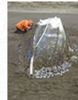
Boat from Japan at Gleneden Beach