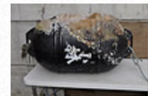
Buoy from Astoria