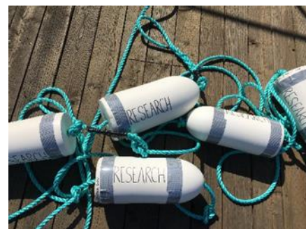
Surface floats on the research gear.

For questions or lost and found research gear, please contact: